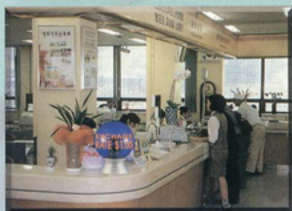
• Financial Institution

AD-BALL is a new conceptual media of advertisement for new products, events and company introduction by displaying informations in 360° through state-of-the-art LEDs inside the specially designed "Ball".