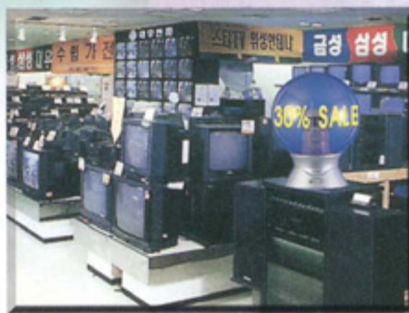
• Shopping Mall