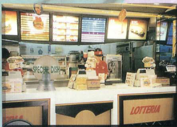
• Franchise store